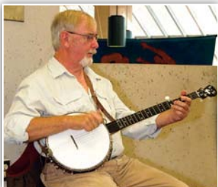
Scenes from our Harvest Moon show!

She would love to hear from members interested in volunteering to be on her list of artists.